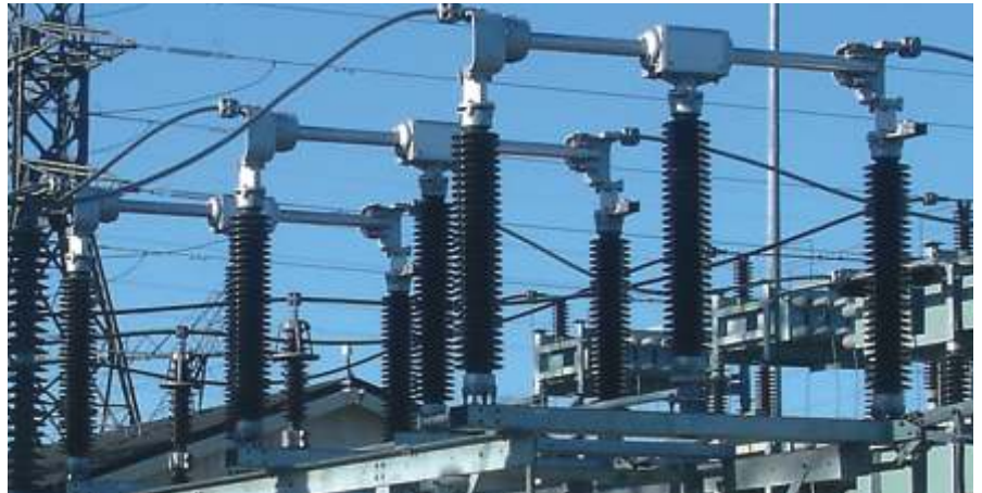
DSB FE isolators.