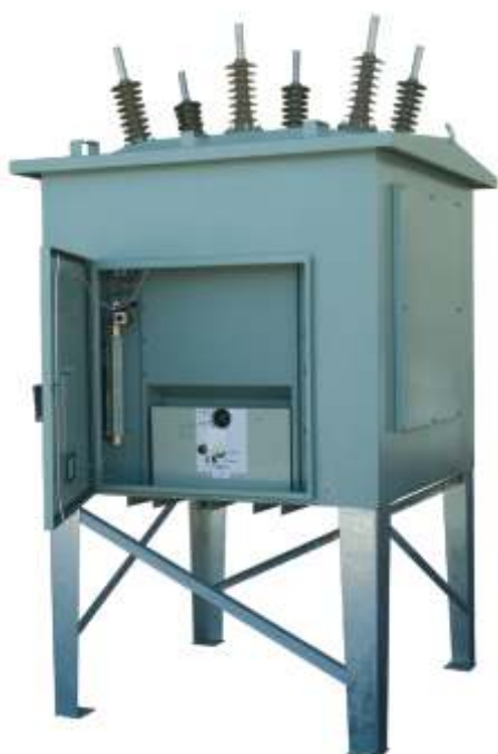
Dog box outdoor circuit breaker.