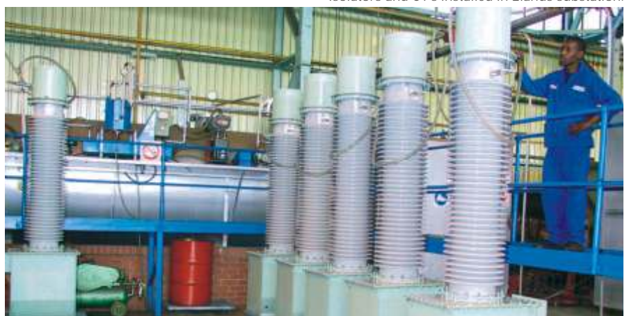
132 kV CT's during oil filling.