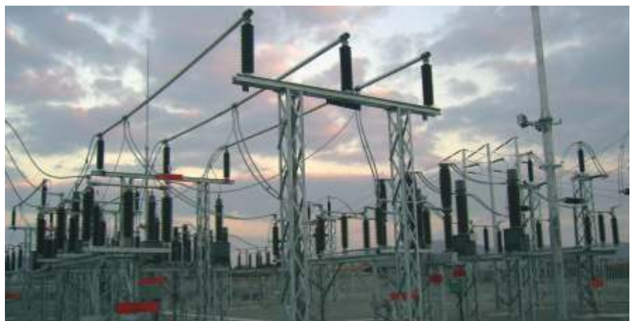
Isolators and CT's installed in Elands substation.