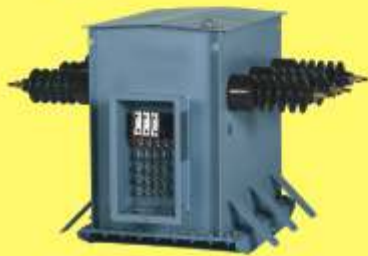
Combined current & voltage transformer.