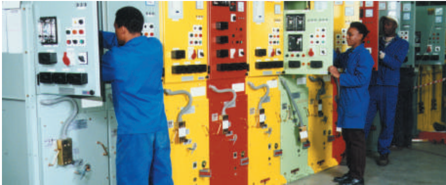
Medium voltage switchboard undergoing preparations for acceptance testing.