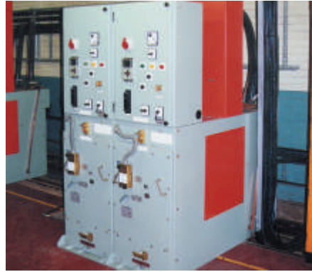
Freestanding SBV 5 capacitor feeders.

that will result from the unlikely event of an internal arc fault – thus affording inherent operator safety. In the case of the duplicate busbar compartment, venting of the lower busbar compartment is effected at the longitudinal end of the switch board.