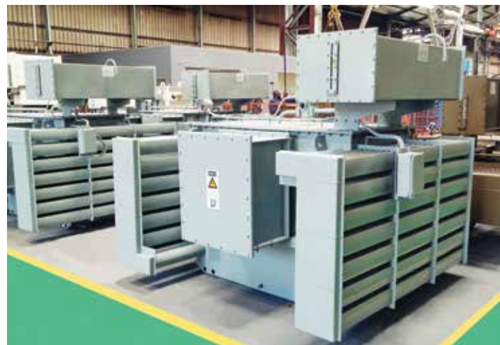
Units being prepared for dispatch in the final assembly department.