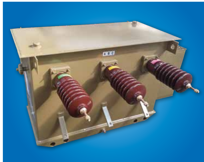
100kVA 22/0.415kV Dyn11 Three phase pole mounted transformer.