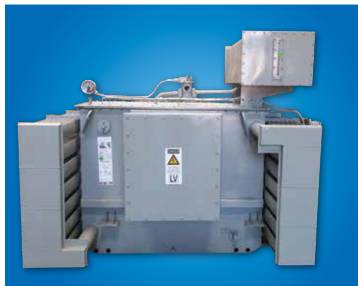
2500kVA 11000/400V ground mounted transformer.