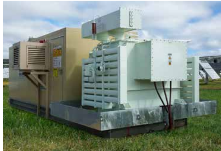
1450kVA 22000/300-300V Dyn11yn11 for a solar farm project.

ACTOM Distribution Transformers has conducted extensive research into the cause and prevention of premature failures of NECRTs. We have therefore adapted the entire design to cater for abnormal service conditions which the NECRTs are predominantly exposed to.