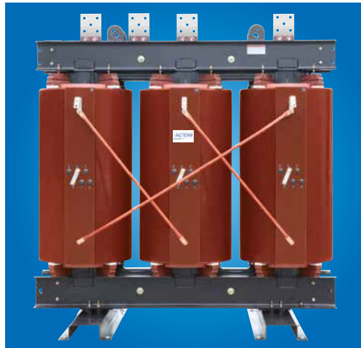
500kVA 11/0.4kV Dyn11 Cast Resin Dry Type Transformer.