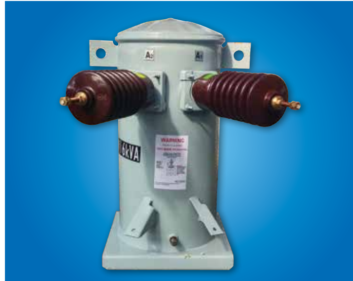
16kVA 22/.24kV Single phase pole mounted transformer.

The SWER isolating transformer is a medium voltage phase to phase connected winding and a 19kV secondary winding for SWER application.