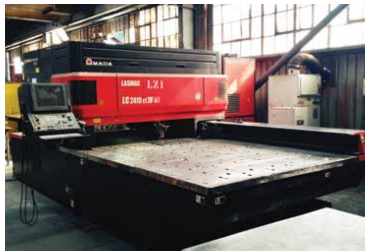
One of our in-house laser cutting machines.