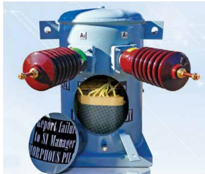
An example of one of the 500 16kVA 22/0.24kV units that were designed and manufactured for Eskom.