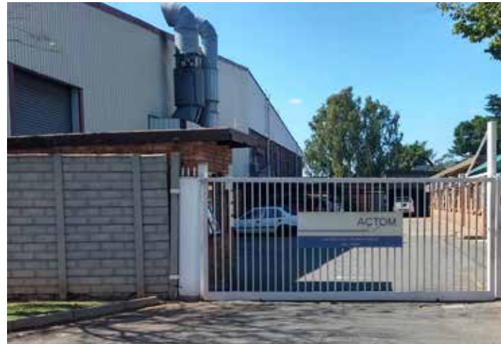
Manufacturing facility located in Gauteng, South Africa.

The transformers are designed, manufactured and tested to the well-established SANS 780 specification, with regular independent auditing of the ACTOM manufacturing facility ensuring that this stringent standard is maintained.