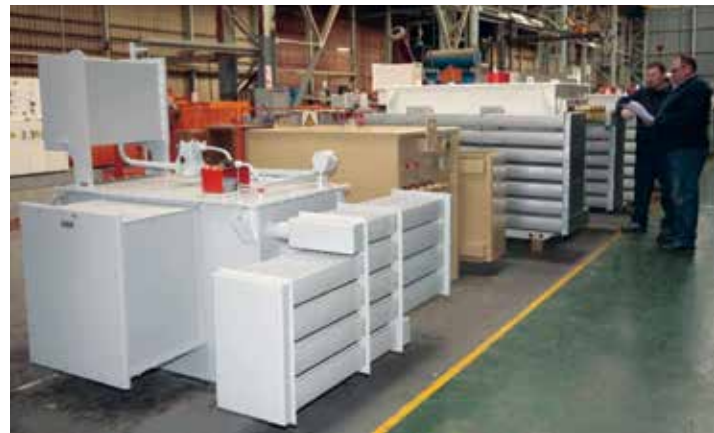
Manufacturing Manager and Production Manager signing off transformers for two solar farm projects and one wind farm project.