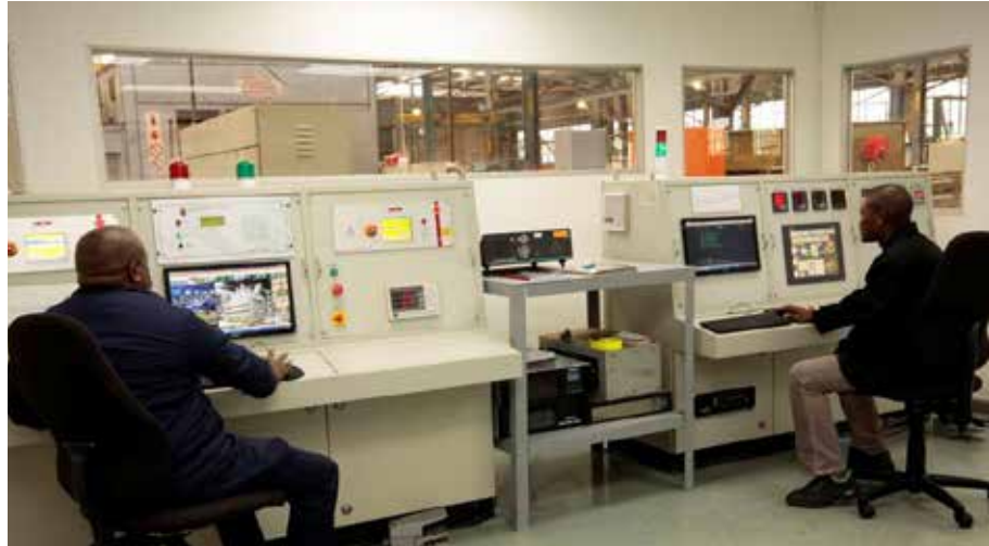
Routine testing being carried out in the Test Bay. Fully automated system on the left and on the right a semi-automated system. Both systems have automatic data capture.