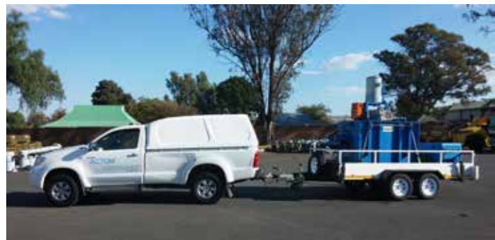
One of our field services vehicles with a mobile oil purification plant.