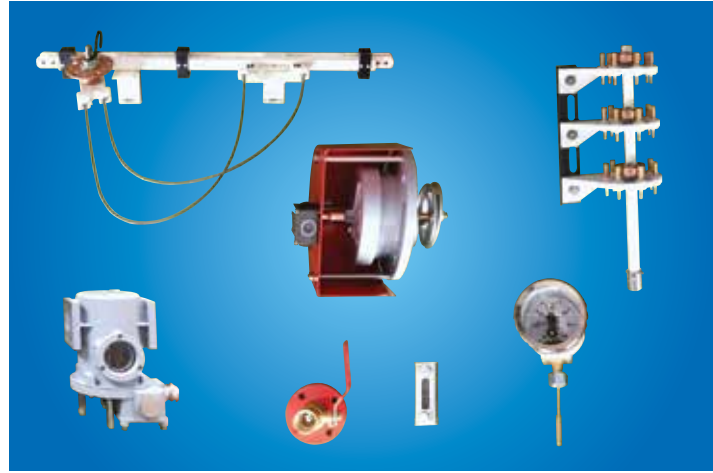
Various transformer accessories.